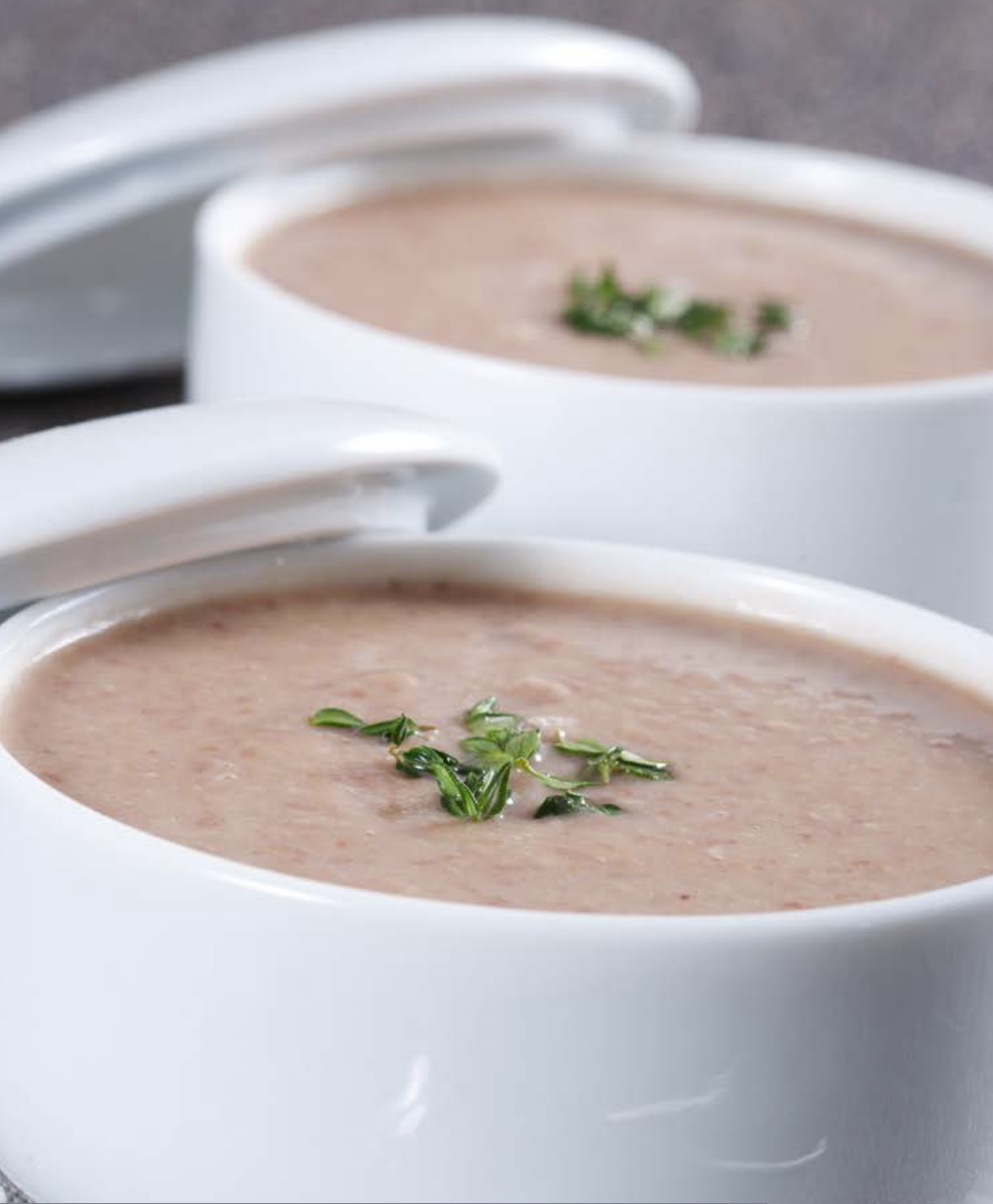
Mushroom and Bean Soup