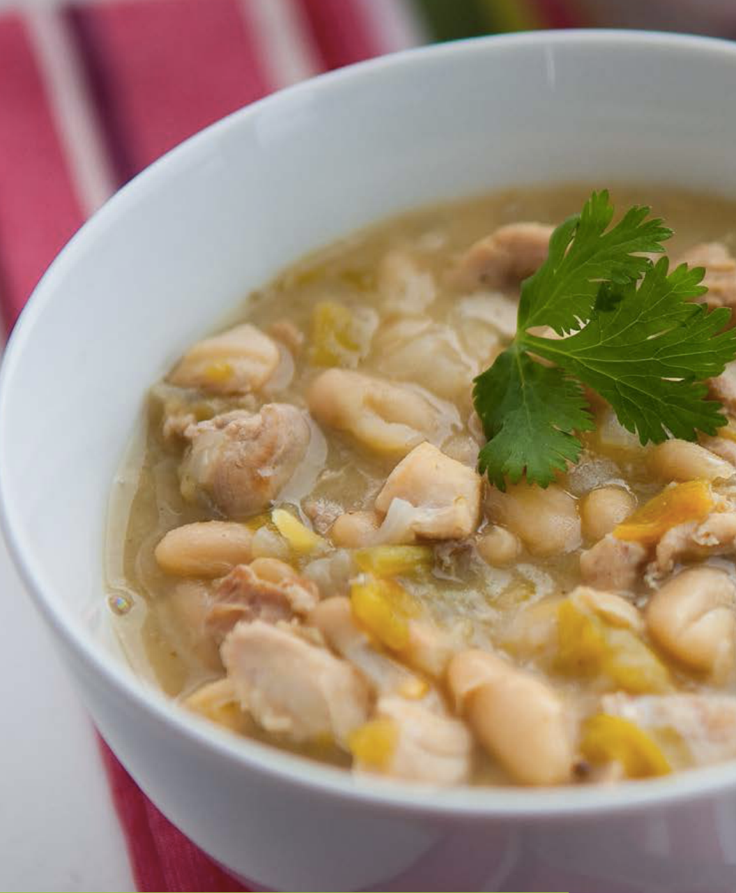
White Chicken Chili